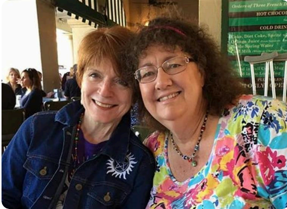
"Family don't end with blood!"